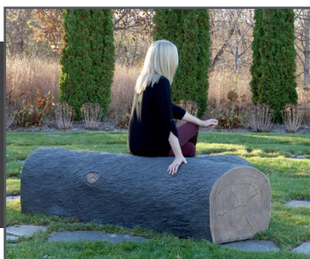
Fallen Tree Bench 5000004