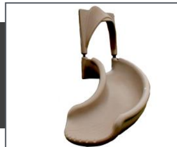
Durable, one-piece Slides