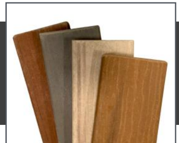
Composite wood provides the look and feel of a handmade creation

~ Dimensions and weights are approximate ~ ~ Heights shown from top of surfacing ~ User Group Age: 2-12